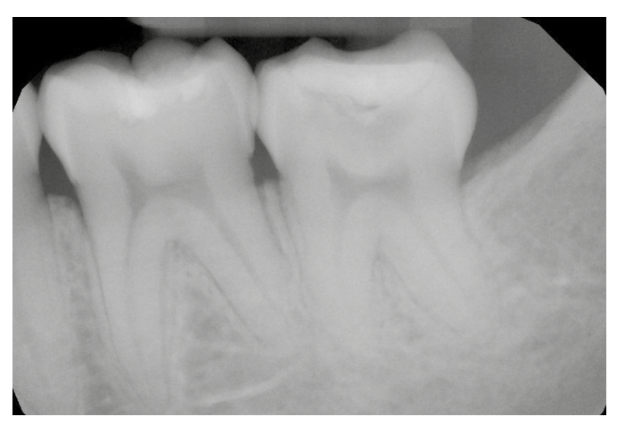
Fig 13 and 14: Pre and post-operative radiographs of the completed endo-restorative procedure are shown. The treatment was completed in one appointment. The cuspal splinting and monolithic restoration should serve the patient for years, even decades, without having to remove the strong "shell" of enamel to make way for a crown. Note: The radiographic appearance of the 3M™ Filtek™ Bulk Fill Flowable Restorative, which is bubble-free, and the slightly more radiopaque 3M™ Filtek™ One Bulk Fill Restorative "paste". The author feels that the radiopacity of these materials is ideal for monitoring recurrent decay.