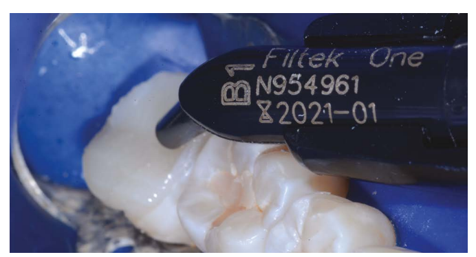
Fig 5: This photo shows the final phase of injection molding the steps of which included: 1) Re-applying Scotchbond™ Universal Adhesive and air thinning without light curing. 2) Injection of warm 3M™ Filtek™ Bulk Fill Flowable Restorative without light curing. 3) Injection of warm Filtek™ One Bulk Fill Restorative.

3M has extensively tested the Filtek™ products described above (material properties, pulp temperature, toxicology, and more) and has determined they can be safely warmed.