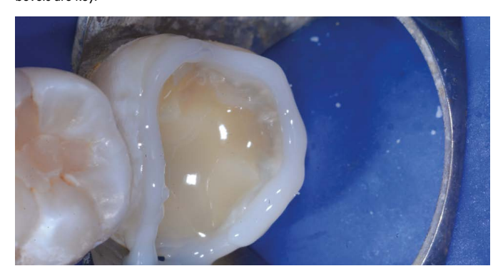
Fig 4: Before final injection molding, a flowable composite "curb" is placed and light cured to improve management of the injection phase.