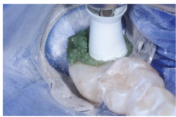
Fig 10: Magic Mix (Bioclear) is worked over the entire tooth-restoration complex to achieve infinity edge margins that are stain resistant. The composite will now have a matte finish with omni-directional scratches. This is the first step of the Bioclear Rockstar Polish.