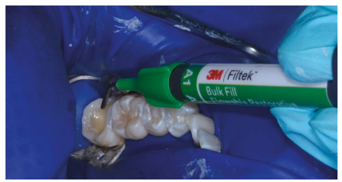
Fig 3: After application and 10 second light curing of 3M™ Scotchbond™ Universal Adhesive, a first layer of 3M™ Filtek™ Bulk Flowable Restorative (Universal Shade) was placed over the gutta percha stumps (counter-sunk 1 mm below the surface) and light cured for 10 seconds using a 3M™ Elipar™ S10 LED Curing Light. The new 3M™ Filtek™ Bulk Fill Flowable Restorative delivery system allows virtually bubble free injection directly on to the prepared tooth and up to a 4 mm depth of cure.