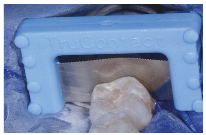
Fig 9: A TruContact Saw (Bioclear) is used to clean and groom the unrestored mesial contact. It is common that adhesive and small bits of flowable can block the occlusal embrasure. Beautiful contacts are an important part of the patient experience.