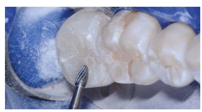
Fig 8: Simple occlusal anatomy is carved with the Q-Finisher® from Komet®